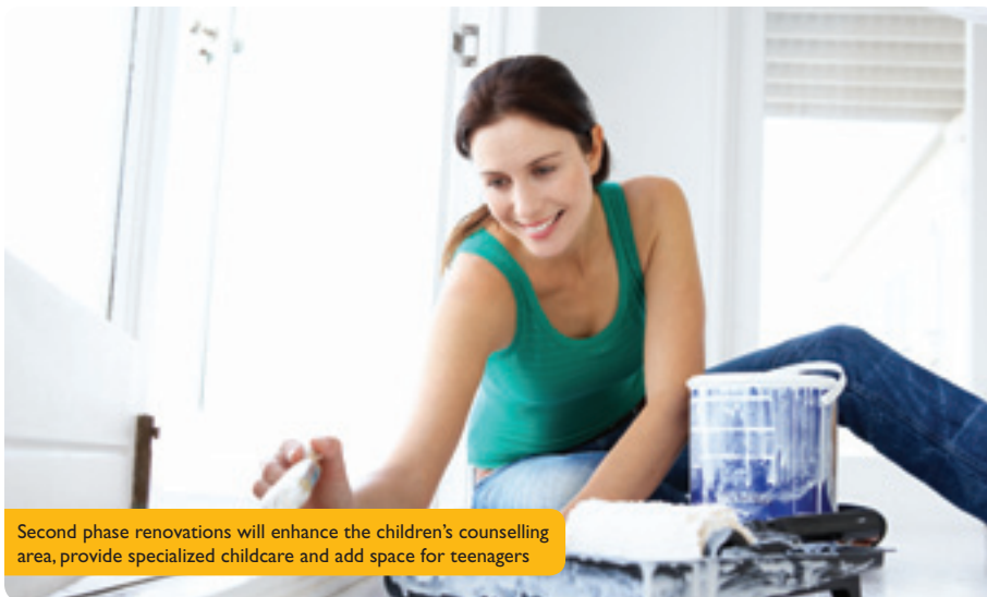
Second phase renovations will enhance the children's counselling area, provide specialized childcare and add space for teenagers

T he Calgary Women's Emergency Shelter building fulfills a critical need in the community. This busy facility supports almost 800 women and children annually who need a secure, safe haven, as well as several hundred more who remain in the community, but access the offered services. The building is now 13 years old and in need of renovations due to considerable wear and tear from the agency's continuous efforts to provide the most effective and innovative programs and services.